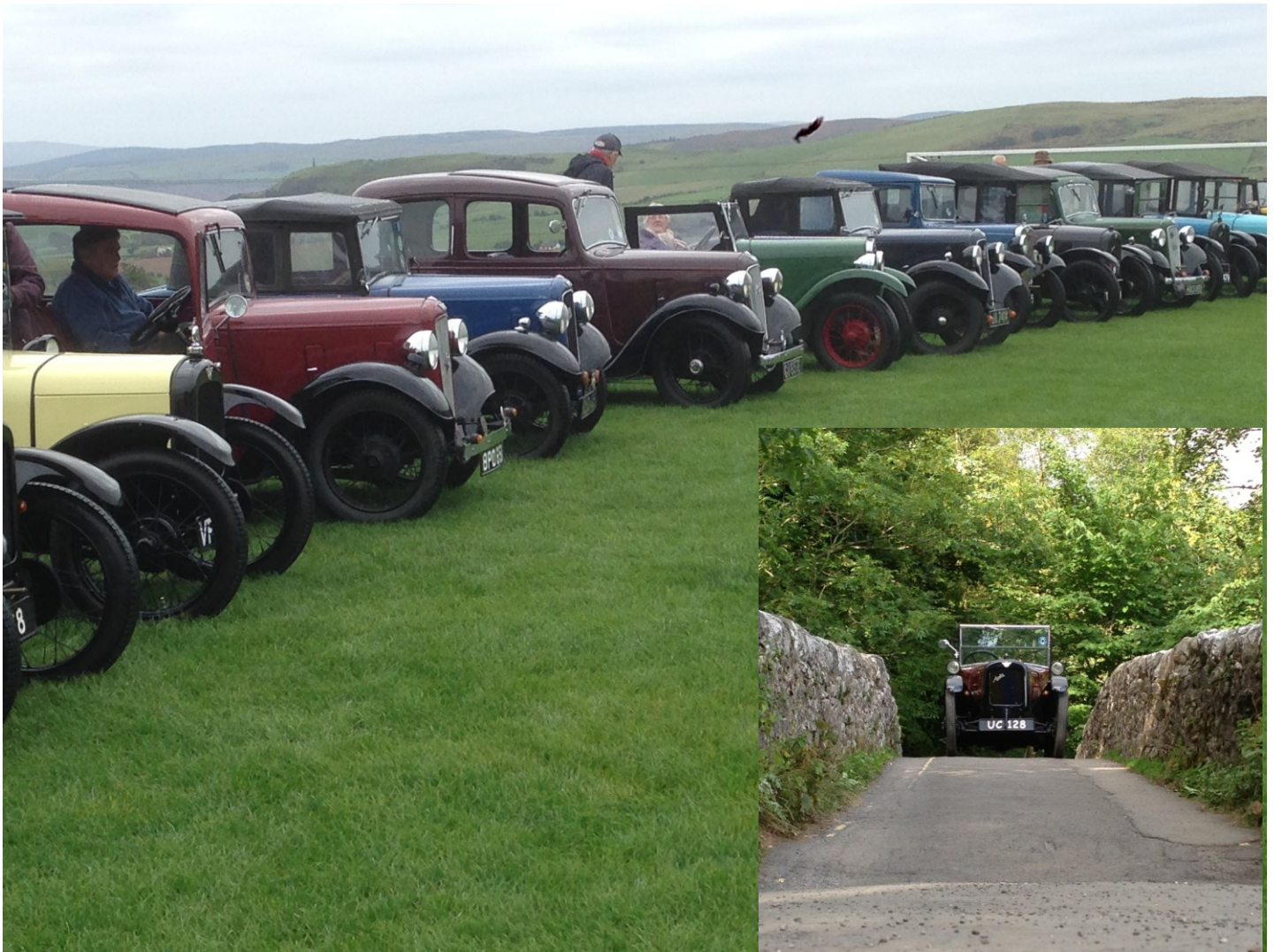
The line up in Settle, Yorkshire and other photos from the same holiday. Send in yours to editor@scottishaustinsevenclub.co.uk