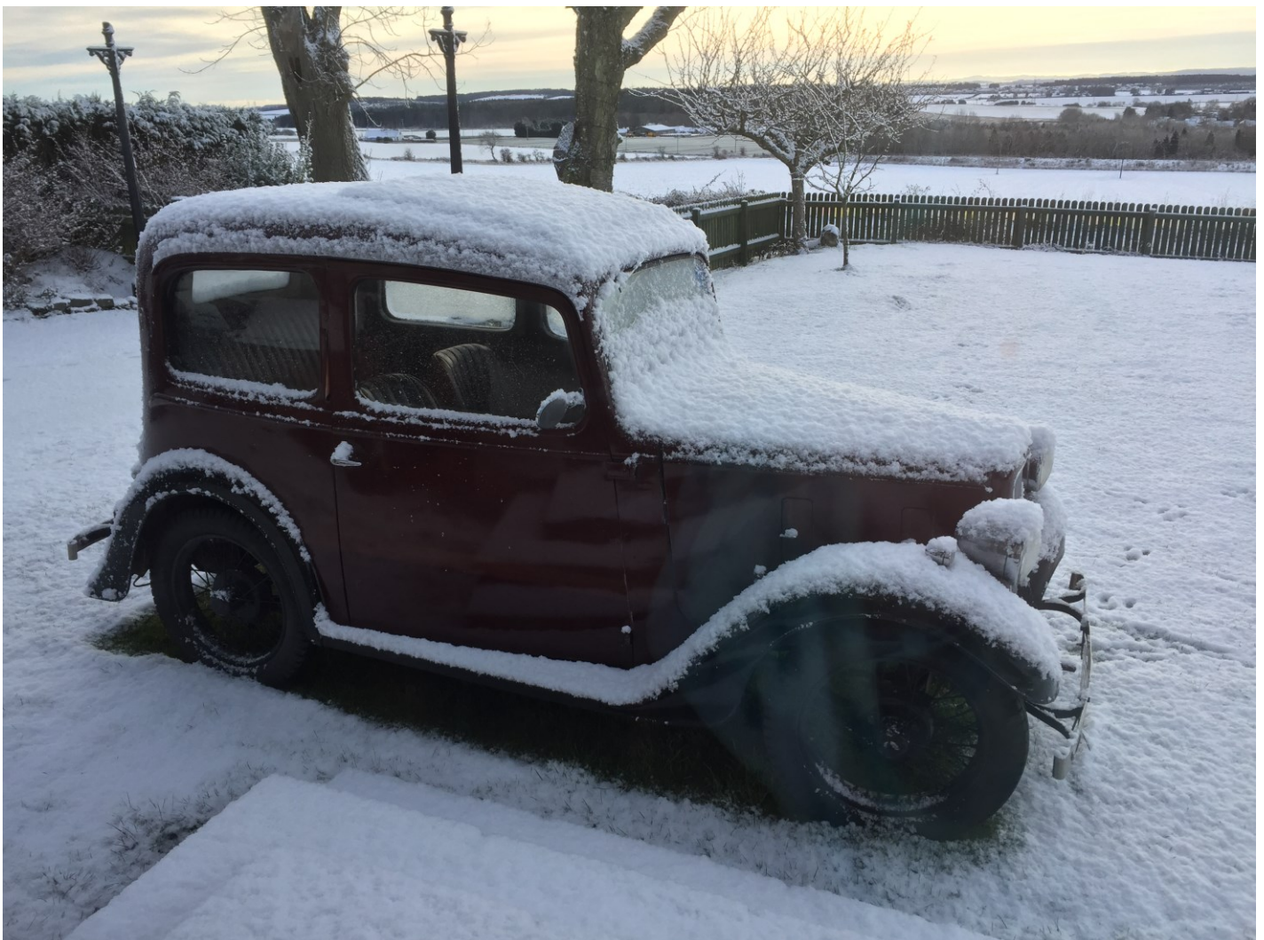
The Goodfellows' Ruby under a blanket of the white stuff